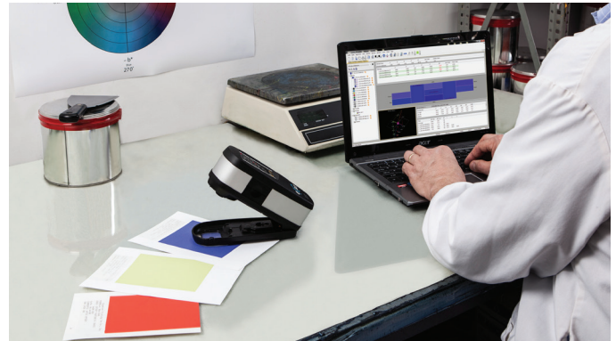
Statistical analysis to keep your business on track

Color iQC Print provides multiple methods for users to select and format color data, directing it to a location or application of choice within the color network. This ability for color systems to share data across time and geography is becoming increasingly important in a fast-paced and highly connected working environment. An easy-to-use application program interface (API) allows direct connectivity to software functionality.